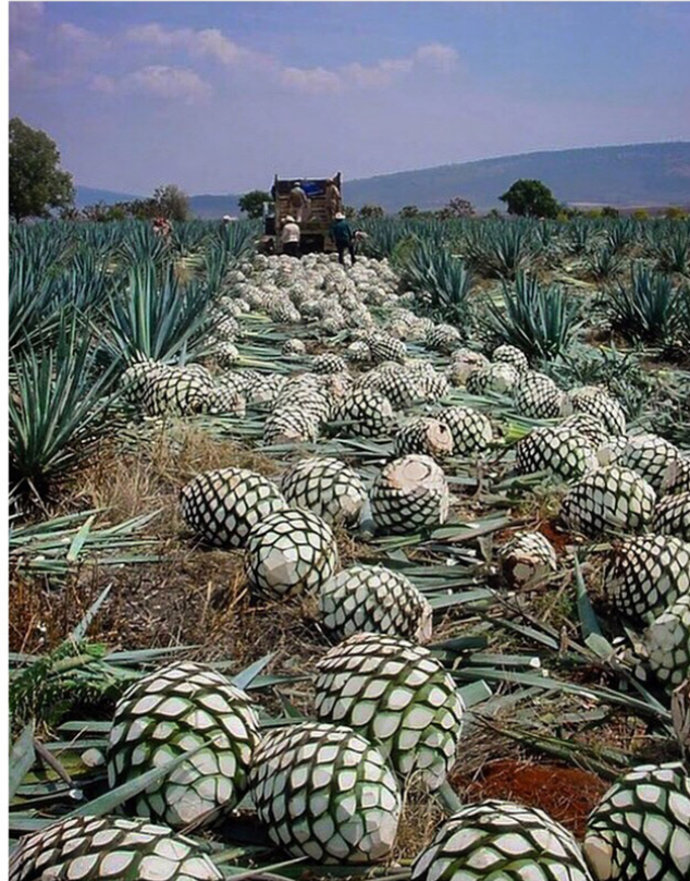
Agave fields in Oaxaca, Mexico